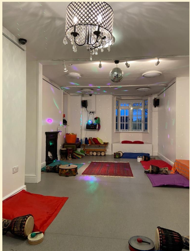
Upstairs workshop space