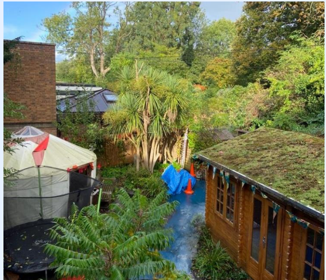
Yurt, cabin and garden space