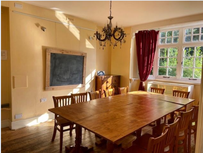
Café dining area