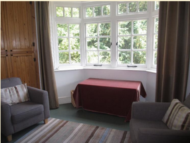
Small breakout room for parents