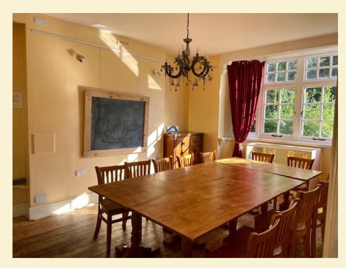
Café dining area