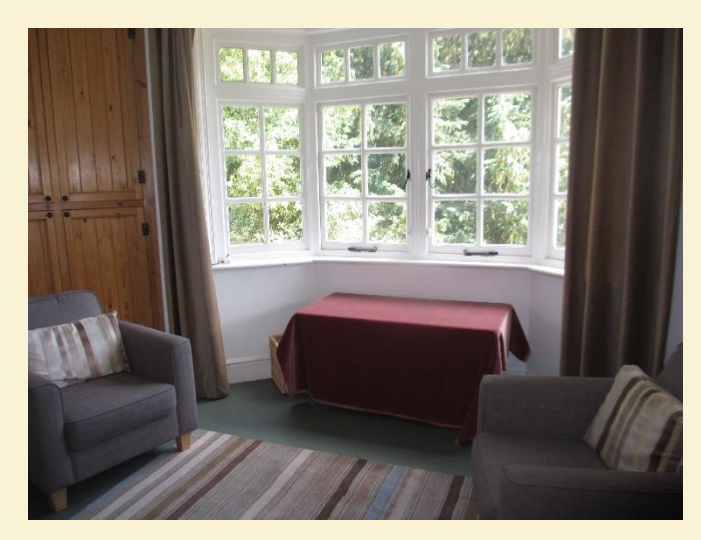
Small breakout room for parents