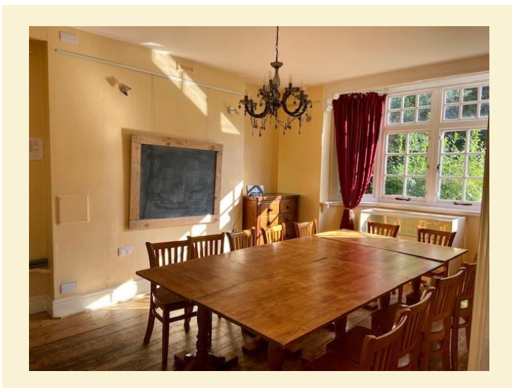
Café dining area