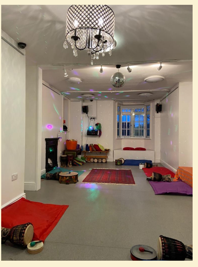
Upstairs workshop space