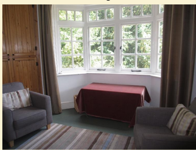
Small breakout room for parents