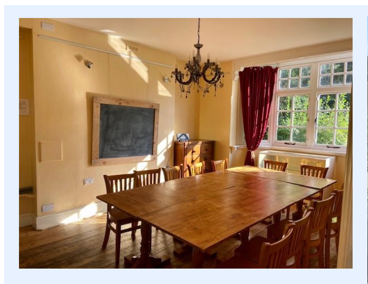
Café dining area