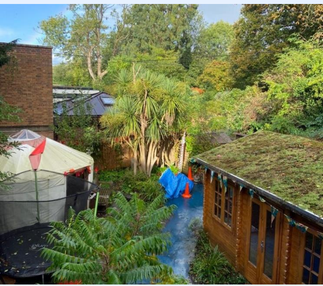
Yurt, cabin and garden space